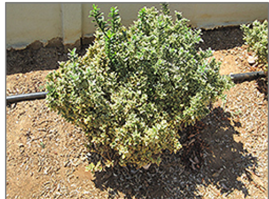
Variegated Boxleaf Japanese Euonymus