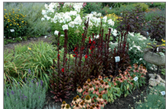
Vulcan Red Lobelia in bloom