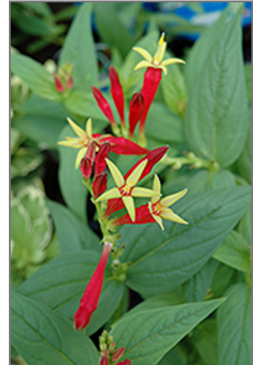
Indian Pink flowers

Indian Pink is recommended for the following landscape applications;