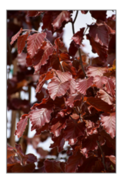
Red Obelisk Beech foliage