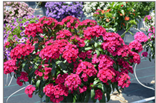
Jolt Cherry Hybrid Pinks in bloom