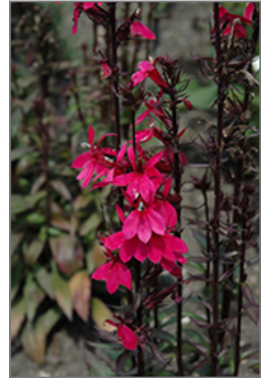
Starship Deep Rose Lobelia flowers

Starship Deep Rose Lobelia is recommended for the following landscape applications;