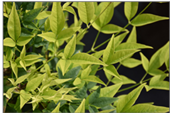
Lemon Lime Nandina foliage