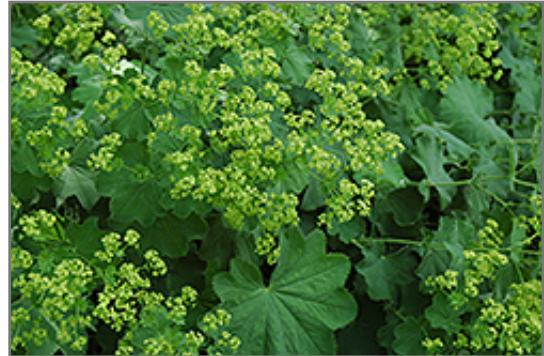
Lady's Mantle flowers

Lady's Mantle is recommended for the following landscape applications;