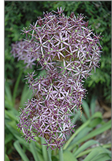
Star Of Persia Onion flowers

Star Of Persia Onion is recommended for the following landscape applications;