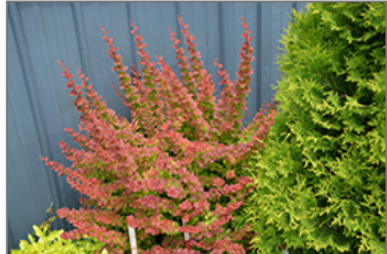
Sunjoy Tangelo Japanese Barberry

Sunjoy Tangelo Japanese Barberry makes a fine choice for the outdoor landscape, but it is also well-suited for use in outdoor pots and containers. Because of its height, it is often used as a 'thriller' in the 'spiller-thriller-filler' container combination; plant it near the center of the pot, surrounded by smaller plants and those that spill over the edges. It is even sizeable enough that it can be grown alone in a suitable container. Note that when grown in a container, it may not perform exactly as indicated on the tag - this is to be expected. Also note that when growing plants in outdoor containers and baskets, they may require more frequent waterings than they would in the yard or garden.