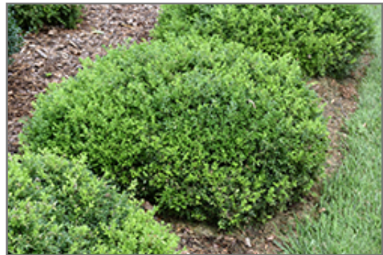
Tide Hill Boxwood