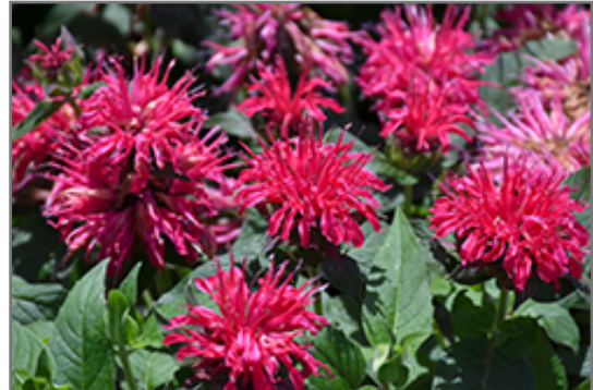
Balmy Rose Beebalm flowers

This plant will require occasional maintenance and upkeep, and should be cut back in late fall in preparation for winter. It is a good choice for attracting bees, butterflies and hummingbirds to your yard, but is not particularly attractive to deer who tend to leave it alone in favor of tastier treats. Gardeners should be aware of the following characteristic(s) that may warrant special consideration;