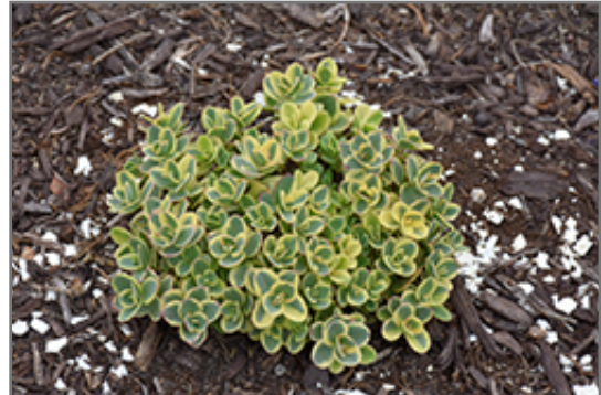
Lime Twister Stonecrop