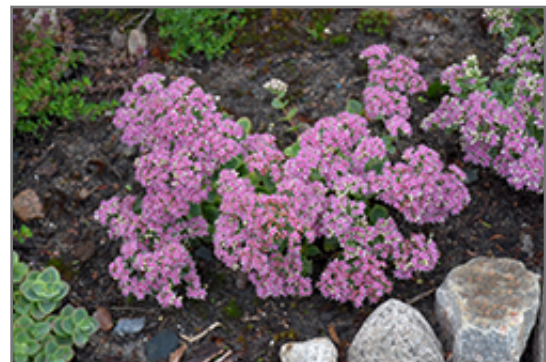
Lime Twister Stonecrop in bloom