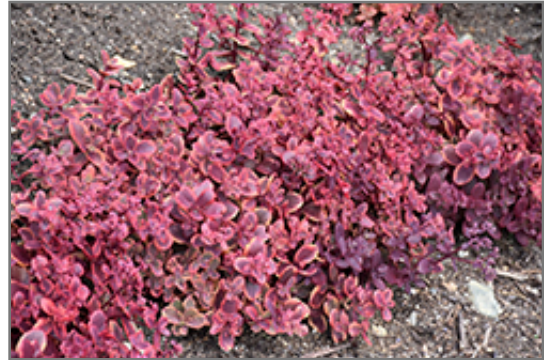
Sunsparkler Wildfire Stonecrop