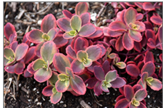
Sunsparkler Wildfire Stonecrop foliage