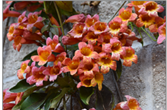
Tangerine Beauty Cross Vine flowers