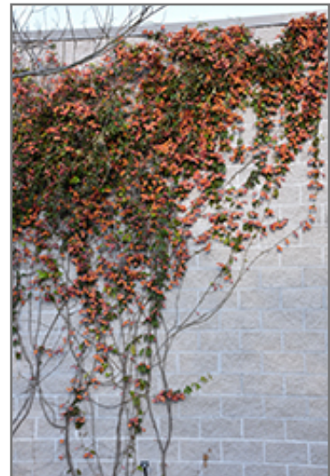
Tangerine Beauty Cross Vine in bloom