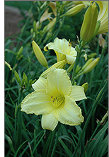
Happy Ever Appster Happy Returns Daylily flowers

Happy Ever Appster Happy Returns Daylily is recommended for the following landscape applications;