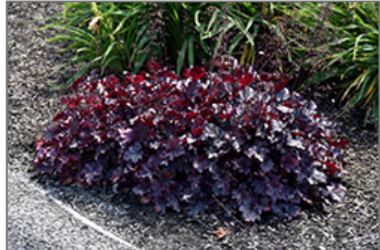
Plum Pudding Coral Bells

Plum Pudding Coral Bells is a fine choice for the garden, but it is also a good selection for planting in outdoor pots and containers. It is often used as a 'filler' in the 'spiller-thriller-filler' container combination, providing a mass of flowers and foliage against which the larger thriller plants stand out. Note that when growing plants in outdoor containers and baskets, they may require more frequent waterings than they would in the yard or garden.