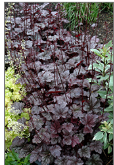
Plum Pudding Coral Bells in bloom