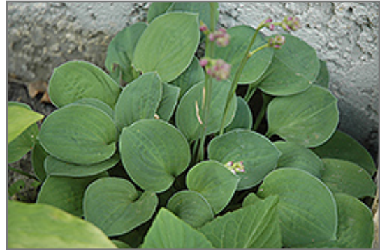
Baby Bunting Hosta foliage