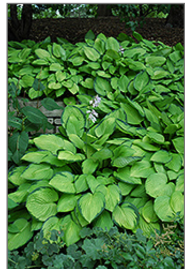
Gold Standard Hosta in bloom