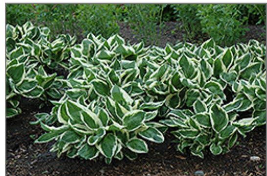
Minuteman Hosta