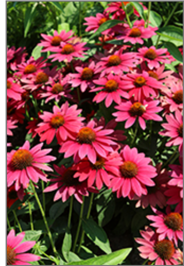
Sombrero Tres Amigos Coneflower flowers

Sombrero Tres Amigos Coneflower is an herbaceous perennial with an upright spreading habit of growth. Its medium texture blends into the garden, but can always be balanced by a couple of finer or coarser plants for an effective composition.