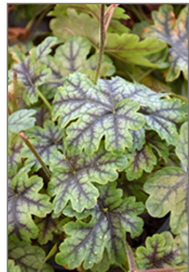
Tapestry Foamy Bells foliage