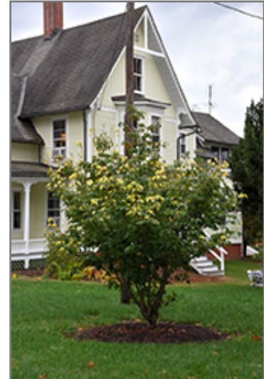
Champion's Gold Chinese Dogwood