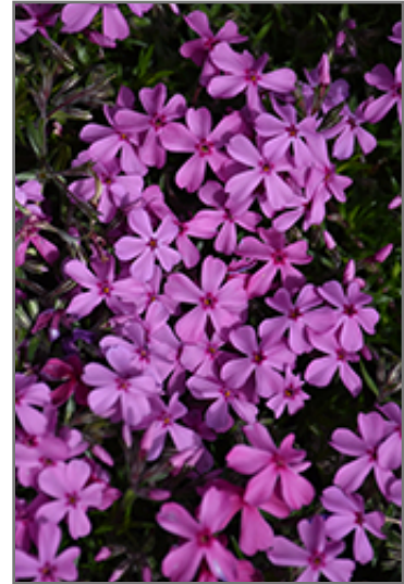
Spring Dark Pink Moss Phlox flowers