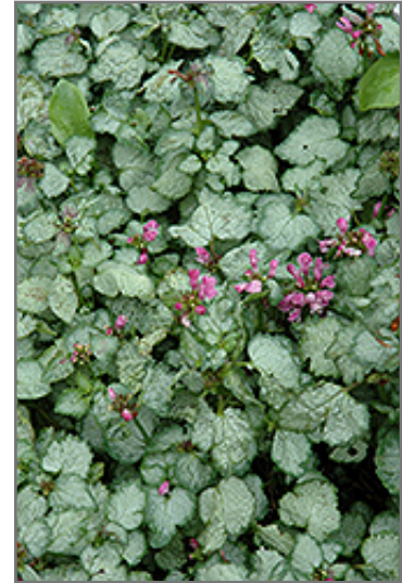
Beacon Silver Spotted Dead Nettle flowers

Beacon Silver Spotted Dead Nettle is recommended for the following landscape applications;