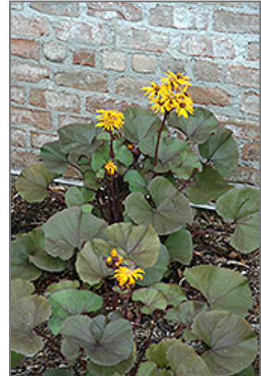
Britt Marie Crawford Rayflower in bloom