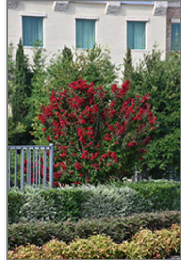
Double Dynamite Crape myrtle in bloom

This shrub does best in full sun to partial shade. It prefers to grow in average to moist conditions, and shouldn't be allowed to dry out. It is very fussy about its soil conditions and must have rich, acidic soils to ensure success, and is subject to chlorosis (yellowing) of the foliage in alkaline soils. It is highly tolerant of urban pollution and will even thrive in inner city environments. This is a selected variety of a species not originally from North America.