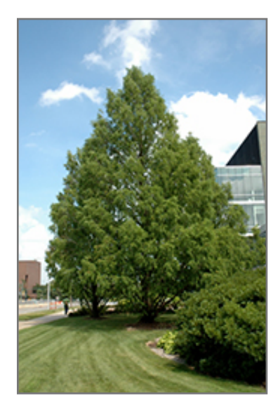
Dawn Redwood