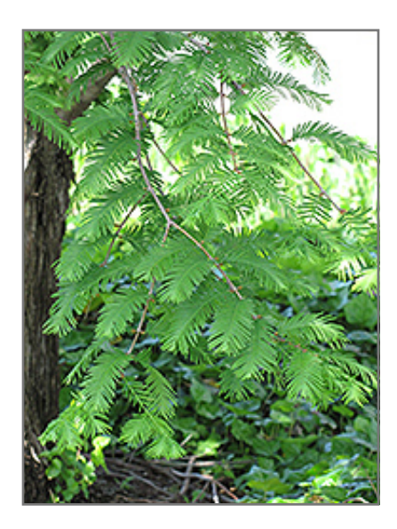
Dawn Redwood foliage