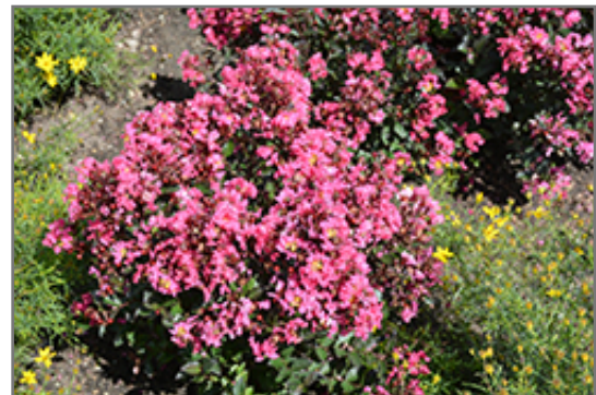
Barista Brew Ha Ha Crape Myrtle in bloom