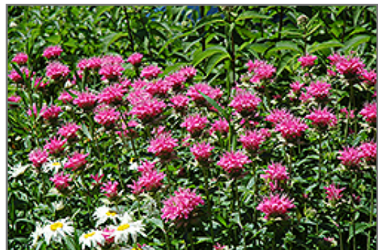
Marshall's Delight Beebalm flowers