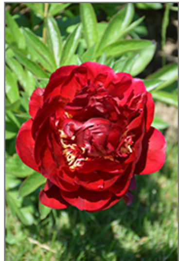
Buckeye Belle Peony flowers