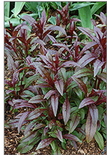
Husker Red Beard Tongue foliage