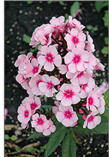
Bright Eyes Garden Phlox flowers

Bright Eyes Garden Phlox is a fine choice for the garden, but it is also a good selection for planting in outdoor pots and containers. With its upright habit of growth, it is best suited for use as a 'thriller' in the 'spiller-thriller-filler' container combination; plant it near the center of the pot, surrounded by smaller plants and those that spill over the edges. It is even sizeable enough that it can be grown alone in a suitable container. Note that when growing plants in outdoor containers and baskets, they may require more frequent waterings than they would in the yard or garden.