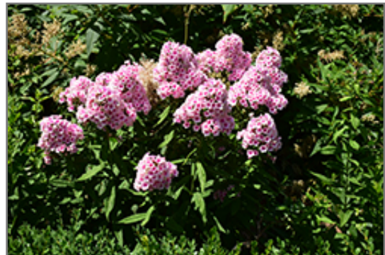
Bright Eyes Garden Phlox in bloom