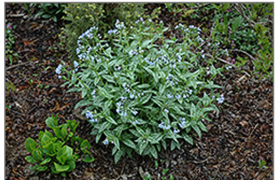
Roy Davidson Lungwort in bloom