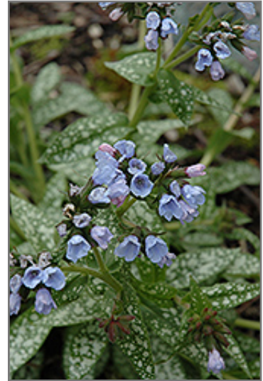
Roy Davidson Lungwort flowers