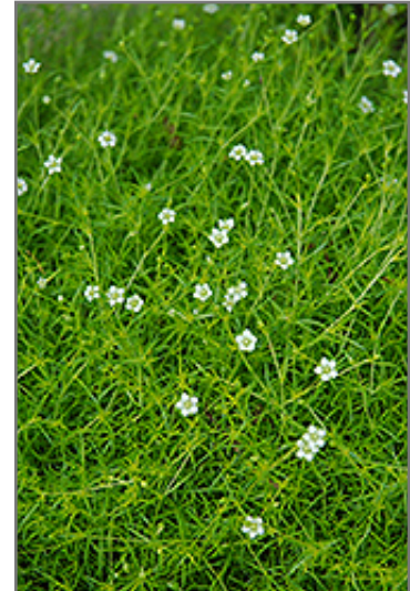
Scotch Moss flowers