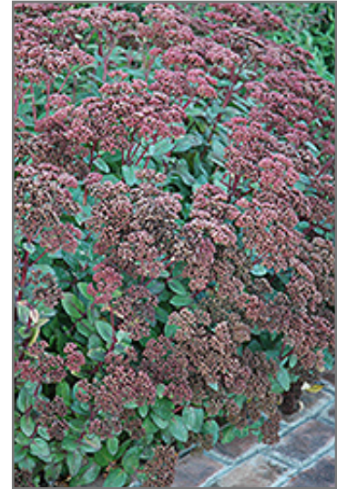
Matrona Stonecrop flowers

Matrona Stonecrop is recommended for the following landscape applications;