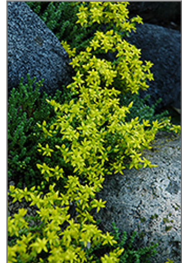
Six Row Stonecrop flowers