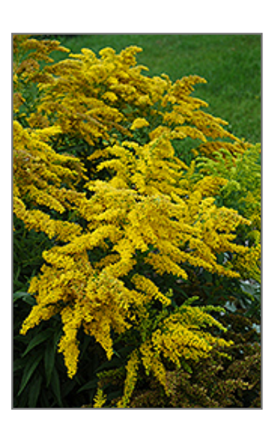
Crown Of Rays Goldenrod flowers