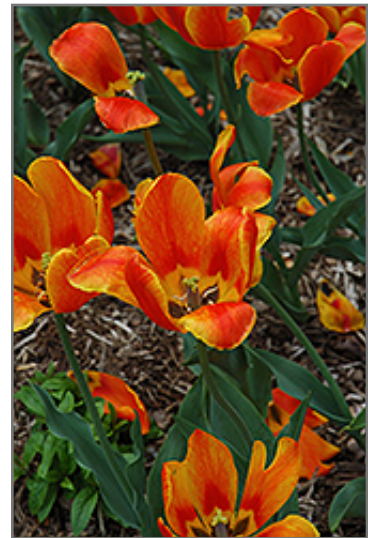
Flair Tulip flowers