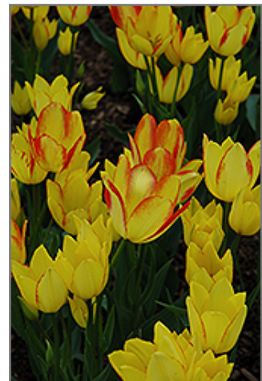
Georgette Tulip flowers