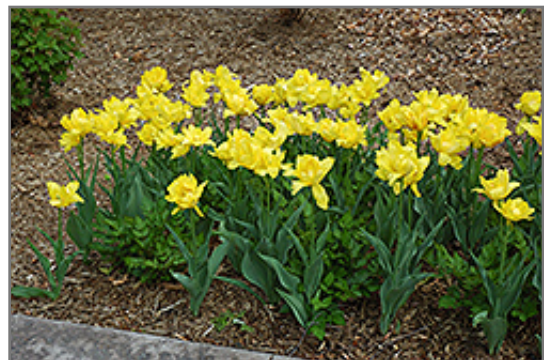
Monte Carlo Tulip in bloom