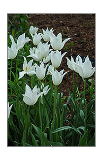
White Triumphator Tulip flowers

White Triumphator Tulip will grow to be about 20 inches tall at maturity, with a spread of 12 inches. When grown in masses or used as a bedding plant, individual plants should be spaced approximately 6 inches apart. The flower stalks can be weak and so it may require staking in exposed sites or excessively rich soils. It grows at a medium rate, and under ideal conditions can be expected to live for approximately 10 years. As an herbaceous perennial, this plant will usually die back to the crown each winter, and will regrow from the base each spring. Be careful not to disturb the crown in late winter when it may not be readily seen! As this plant tends to go dormant in summer, it is best interplanted with late-season bloomers to hide the dying foliage.