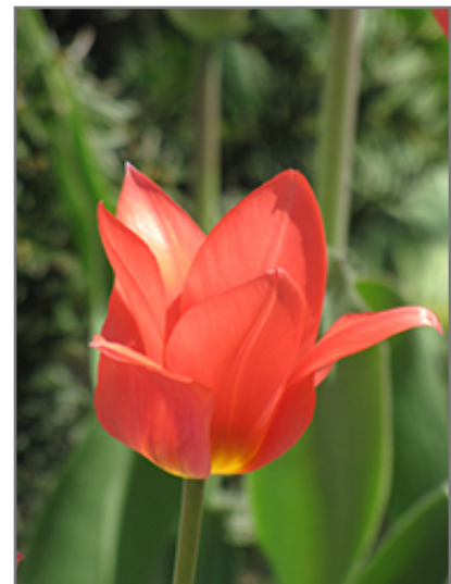
Red Emperor Tulip flowers