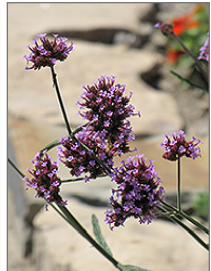
Tall Verbena flowers