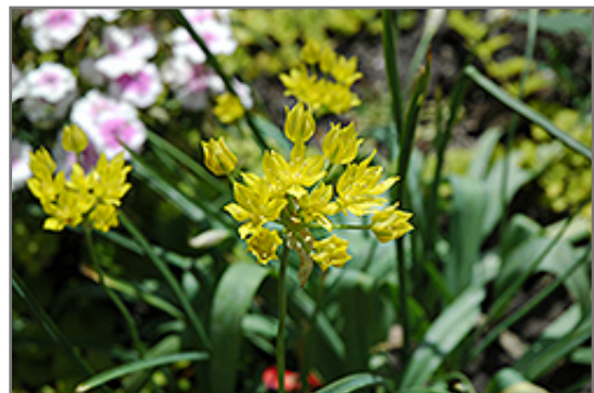
Golden Garlic flowers