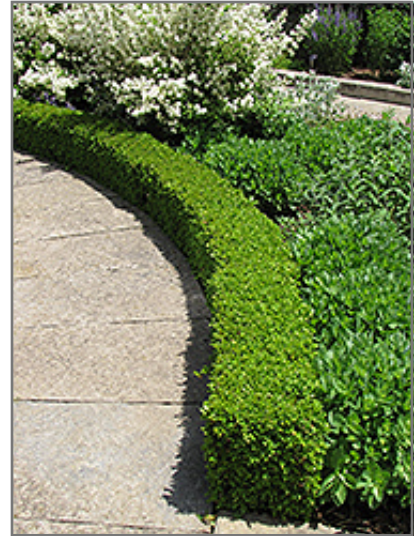
Green Velvet Boxwood

Green Velvet Boxwood makes a fine choice for the outdoor landscape, but it is also well-suited for use in outdoor pots and containers. Because of its height, it is often used as a 'thriller' in the 'spiller-thriller-filler' container combination; plant it near the center of the pot, surrounded by smaller plants and those that spill over the edges. It is even sizeable enough that it can be grown alone in a suitable container. Note that when grown in a container, it may not perform exactly as indicated on the tag - this is to be expected. Also note that when growing plants in outdoor containers and baskets, they may require more frequent waterings than they would in the yard or garden.