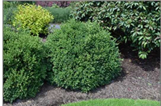
Green Velvet Boxwood

Green Velvet Boxwood is recommended for the following landscape applications;