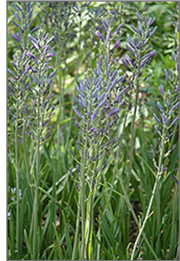
Blue Camassia flowers

Blue Camassia is recommended for the following landscape applications;