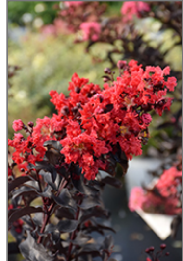
Center Stage Red Crape Myrtle flowers

Center Stage Red Crape Myrtle is recommended for the following landscape applications;