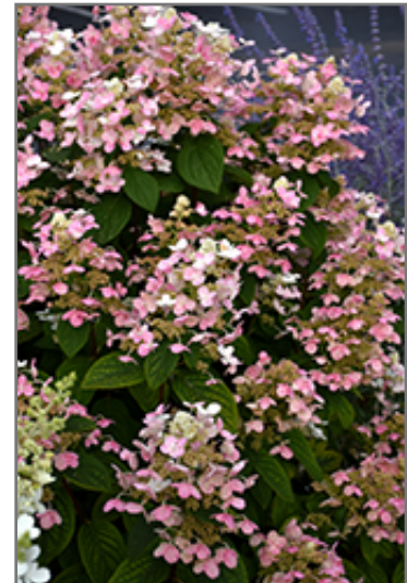
Quick Fire Hydrangea flowers