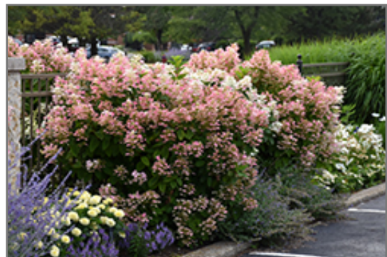
Quick Fire Hydrangea in bloom