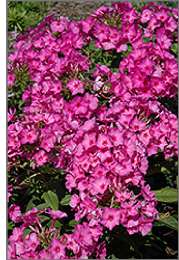
Flame Pink Garden Phlox flowers